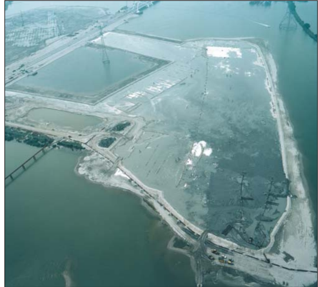
Hydraulic fill operation

woven polyester with an ultimate tensile strength of 400 kN/m was required.