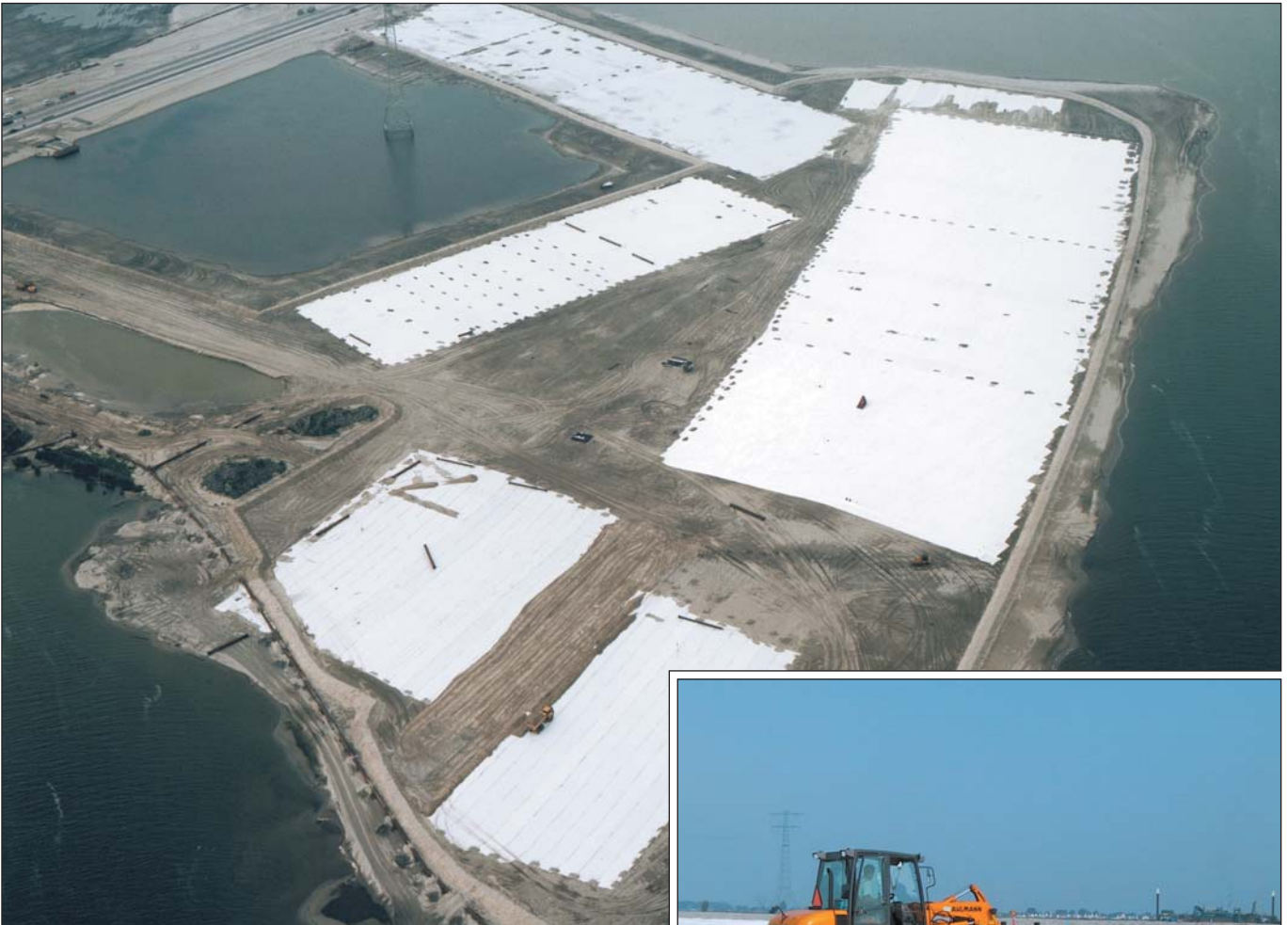
Aerial view of Steigereiland, IJburg

Location: Amsterdam, The Netherlands IJburg, Steigereiland, Island on soft subgrade Consultant: Ingenieursbureau Amsterdam and OMEGAM Contractor: Combinatie IJburg (Ballast Nedam, HAM and others) Year of Construction: 2001 Product: HaTe® PES 400/50