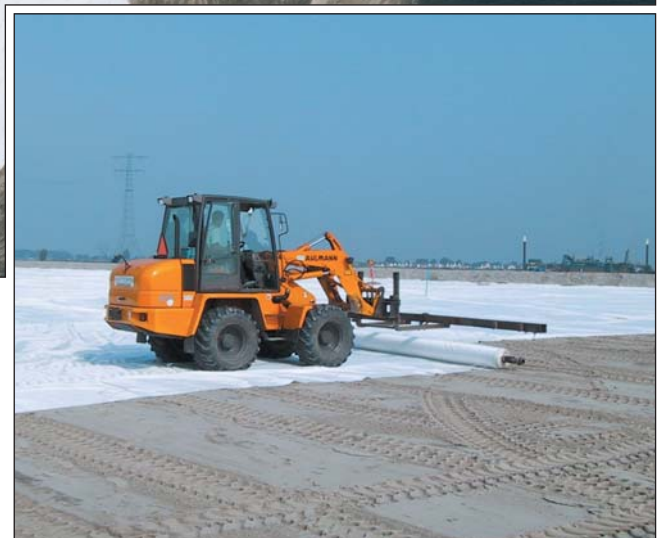
Placement of HaTe® PES 400/50

Location: Amsterdam, The Netherlands IJburg, Steigereiland, Island on soft subgrade Consultant: Ingenieursbureau Amsterdam and OMEGAM Contractor: Combinatie IJburg (Ballast Nedam, HAM and others) Year of Construction: 2001 Product: HaTe® PES 400/50