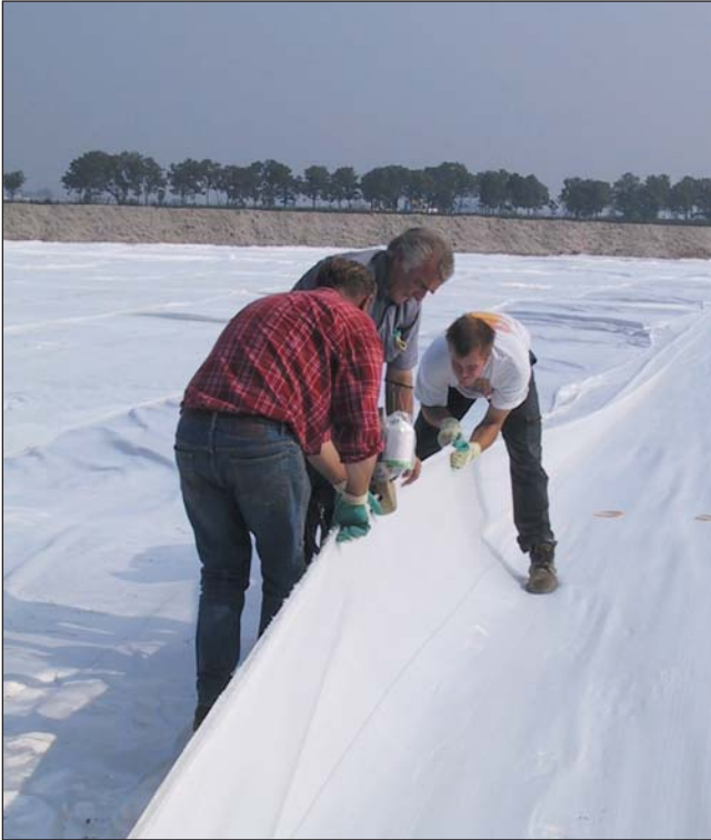
Sewing large panels